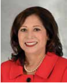
HILDA L. SOLIS Supervisor, First District